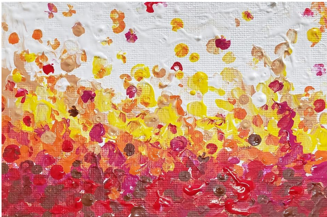
Art4Healing® Live Participant

Art & Creativity for Healing has a Facebook page titled Art4Healing® Creations . This group is open to the public to view, however to join the group, you must have taken an online class, workshop, or certification to join. You can connect with other participants and share your paintings through our social media! This will allow you to also stay up to date with upcoming workshops as well.